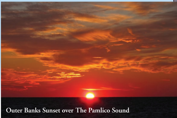
Outer Banks Sunset over The Pamlico Sound