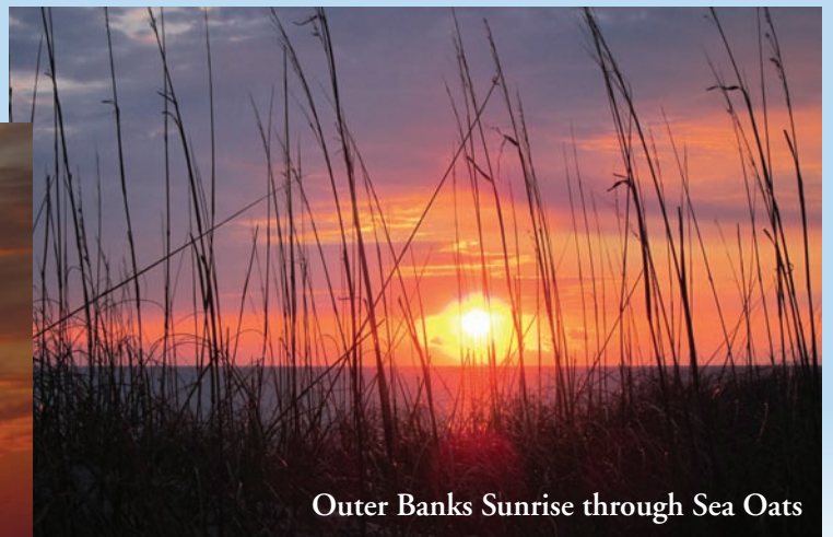
Outer Banks Sunrise through Sea Oats

On a recent trip to the Outer Banks I could not resist capturing these two shots of a beach sunrise and sunset.